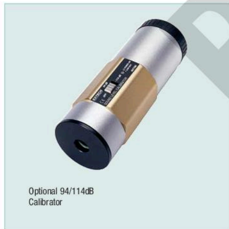
Optional 94/114dB Calibrator